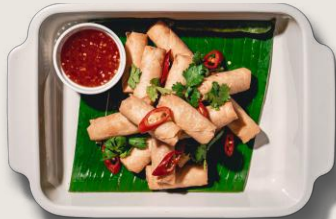
Vegetable Spring Roll 🌿👑 cabbage, tofu, wood ear mushroom vegan, contains soy, wheat