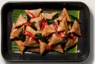
Indian Spiced Samosa 🌿 turnip, carrot, mixed spice vegan, spicy, contains allium, wheat