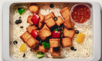
Cod Fish Tofu Bites 👑 fish meat tofu cube, tricolour capsicum, thai chilli sauce pescatarian, contains dairy, soy, wheat