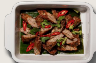
Prawn Roll (Ngoh Hiang) 👑 crispy beancurd skin, mushroom, five spice powder contains allium, soy, shellfish