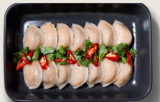
Steamed Mini Soon Kueh 🌿 turnip, carrot, mushroom vegan, contains wheat