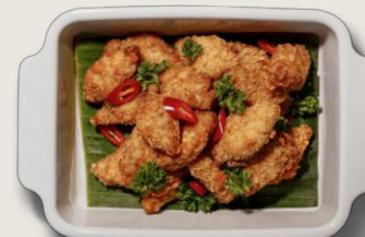
Seafood Croquette deep fried golden seafood potato pescatarian, contains allium, dairy, egg, shellfish, wheat