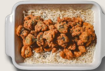
Japanese Karaage lightly battered chicken, thai chilli sauce contains allium, dairy, soy, wheat